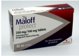
Maloff Protect 36 Tablets £56.99 inclusive of UK ONLY fully Tracked Delivery