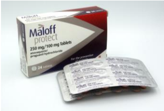
Maloff Protect 24 Tablets £36.99 inclusive of UK ONLY fully Tracked Delivery