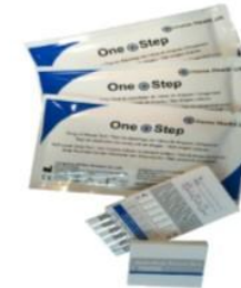
Fig.3 Multi-Drug Panel Test

Due to the sensitive nature of this drugs test, you must be careful when carrying out the test to avoid contamination and thus inaccurate test results. Please read these instructions carefully before beginning the test.