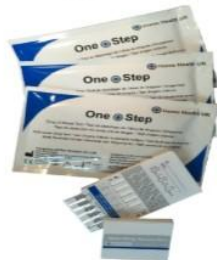
Fig.3 Multi-Drug Panel Test

Due to the sensitive nature of this drugs test, you must be careful when carrying out the test to avoid contamination and thus inaccurate test results. Please read these instructions carefully before beginning the test.