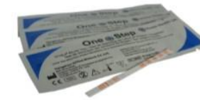
Fig.1 Single Drug Strip Test

This test is very accurate and the sensitivity levels meet the U.S.A. SAMHSA (Substance Abuse and Mental Health Services Administration) standards and recommended levels set by the National Institute on Drug Abuse (NIDA). There is however a possibility of false results due to the interference of other substances in the urine. One of the most common substances that causes false positives is Codeine , which is found in a variety of over-the-counter painkillers, including Nurofen Plus and Co-codamol. These products will give a positive result on an opiate / morphine test. It would be advisable to ask the person being tested if they are on any prescription drugs for medical purposes before the test is carried out.