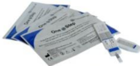
Fig.2 Single Drug Panel Test