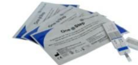
Fig.2 Single Drug Panel Test