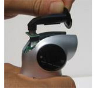
Re-attach the breath tube directly on to the sensor. Make sure the front opening is aligned.