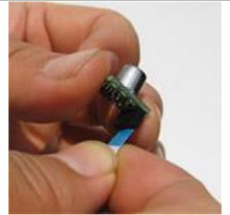
Insert the cable into the new sensor. Make sure the blue strip is toward the sensor, as shown.