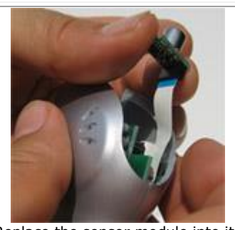
Replace the sensor module into its original position.